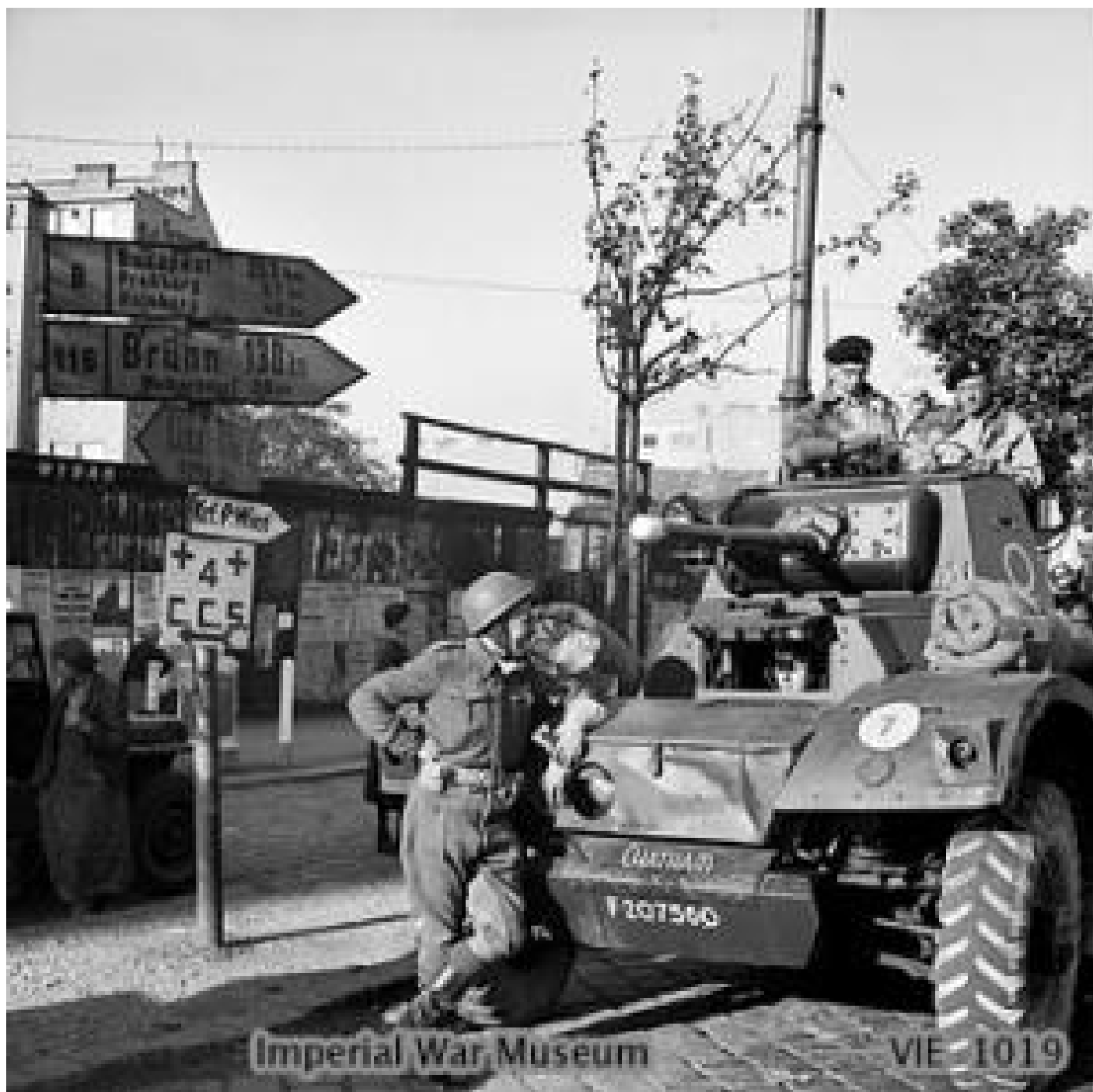
Reference VIE 1019

Description: An armoured car F207560 of the 12th Royal Lancers arrives in Vienna where the regiment took over garrison duties from the 2nd Battalion, Lancashire Fusiliers. The regiment was stationed at Meidling Barracks.