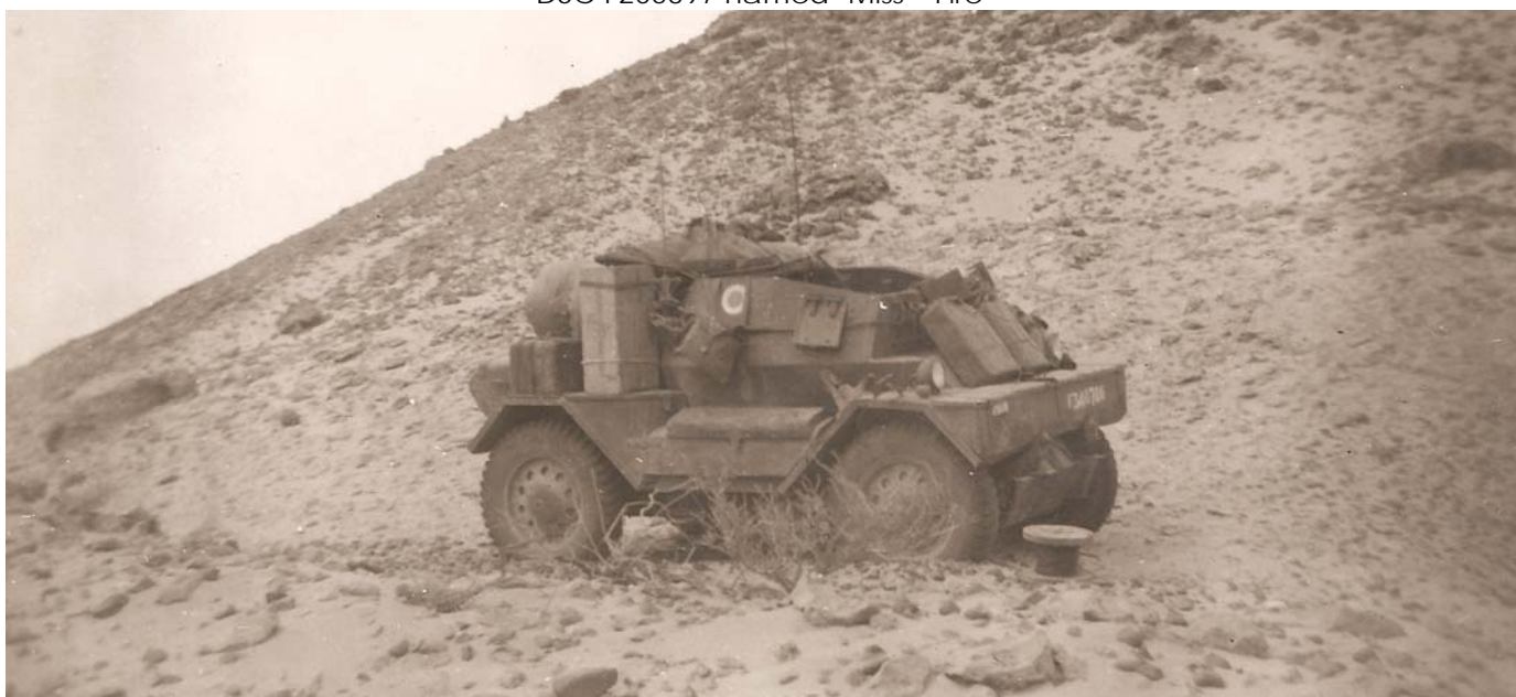
DSC F340786 named 'Maidens Prayer'