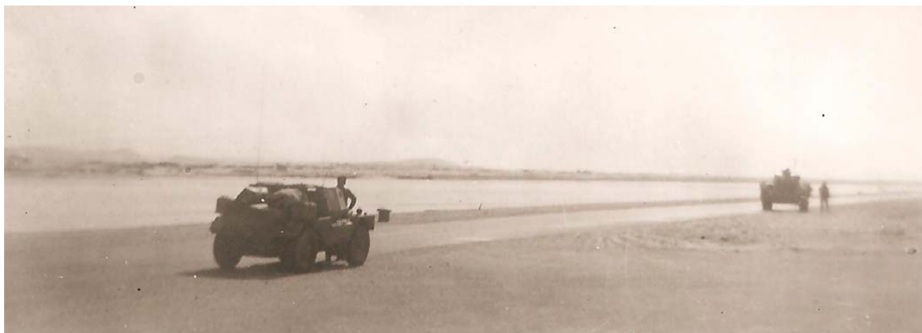
On patrol along the Canal