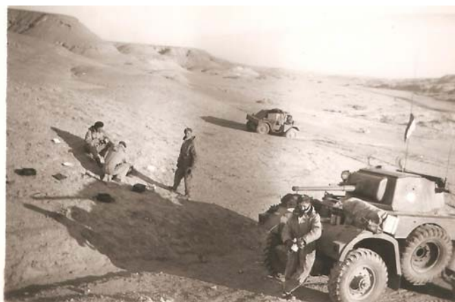
Description: An armoured cars of 1 st Troop, C Squadron, 16-5 th Lancers. Circa 1946 -47

Cfn R Barnes REME confirms that the 16/5 th used Daimler scout cars in Egypt between 1949 and 1950, these were withdrawn from service and replaced with new Humbers.