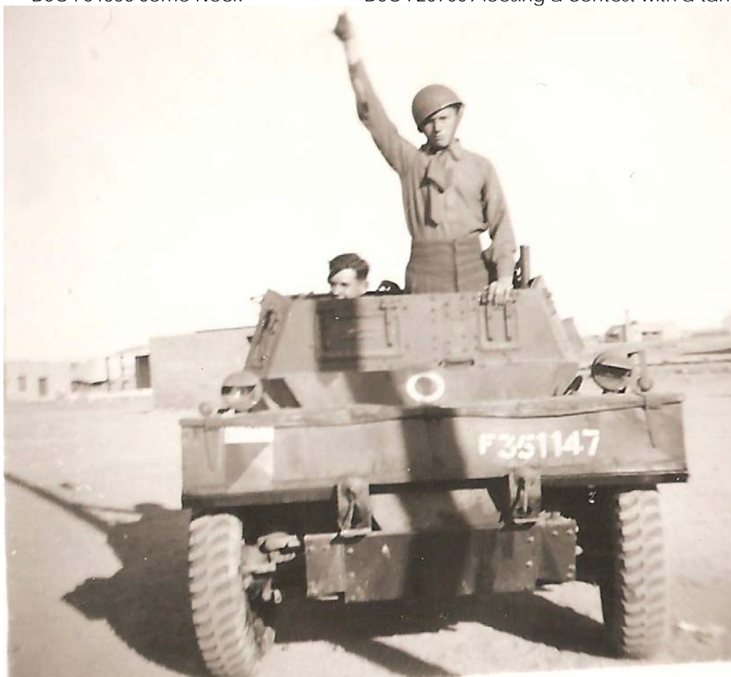
DSC F351147, 25th December 1946, everyone is drunk!

Description: An armoured cars of 1st Troop, C Squadron, 16-5th Lancers. Circa 1946 -47