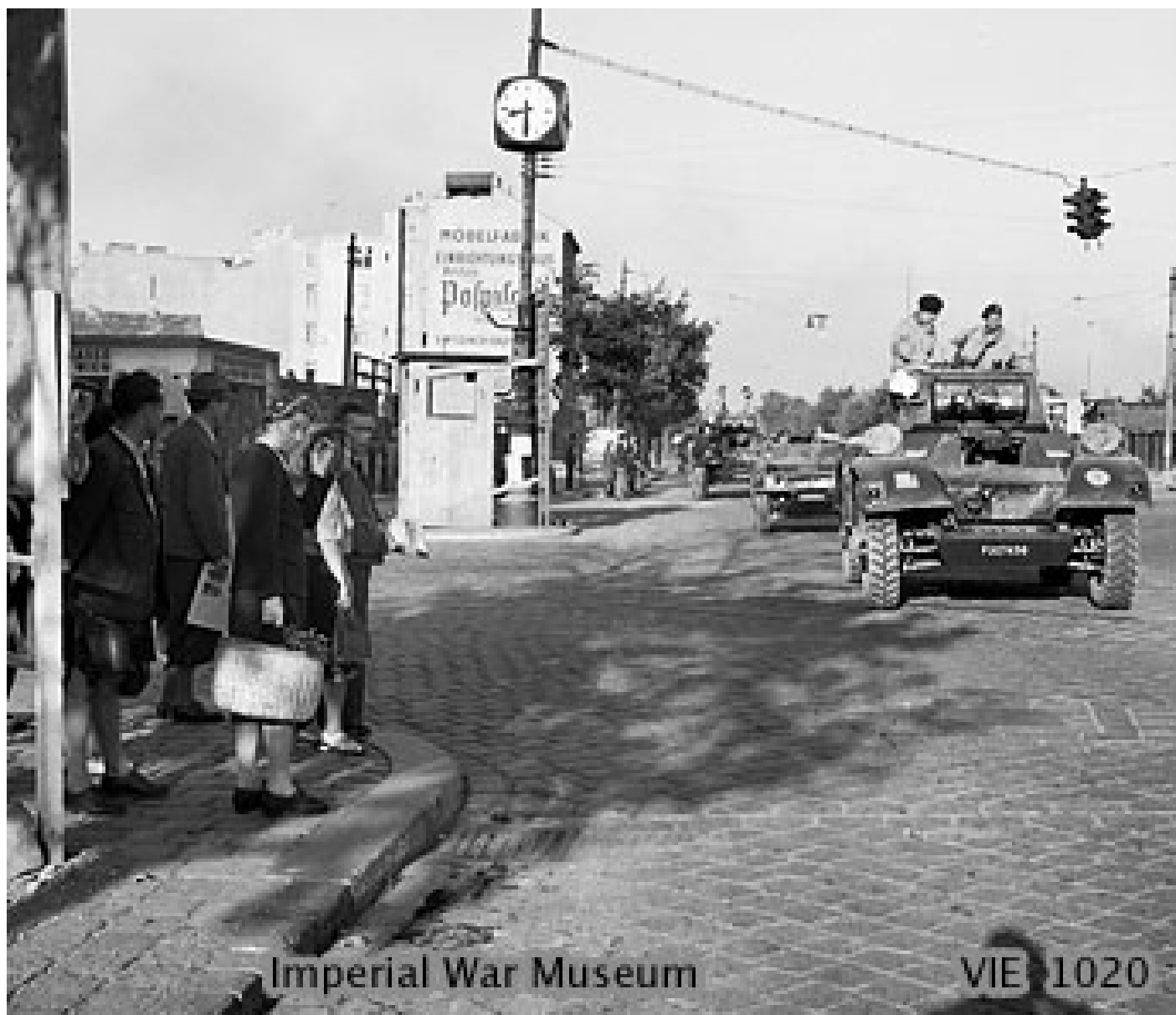
Photo sourced from Imperial War Museum VIE 1020 Photographer: Lambert R P (Sergeant) of No 2 Army Film & Photographic Unit

Description:..Armoured cars (F207434) and scout cars of the 12th Royal Lancers move through Vienna towards Meidling Barracks where the regiment took over garrison duties from the 2nd Battalion, Lancashire Fusiliers.