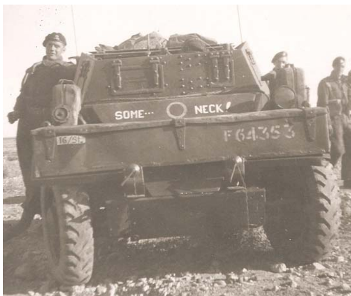
DSC F64353 Some Neck