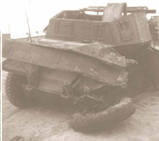
DSC F207009 loosing a contest with a tank transporter