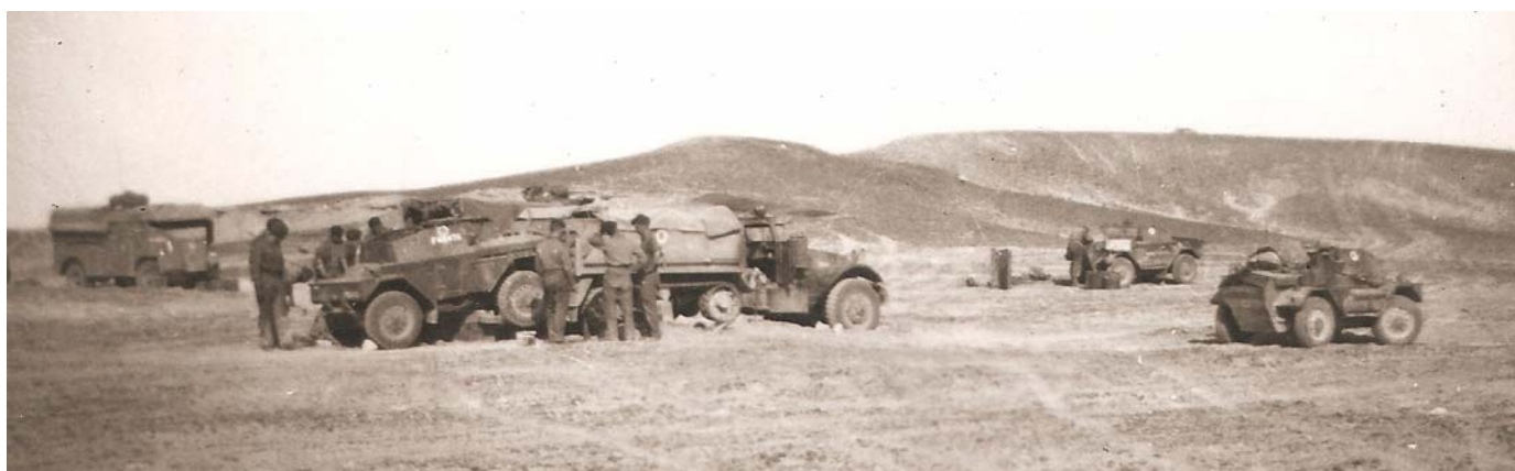
DSC F48476 being recovered after a breakdown