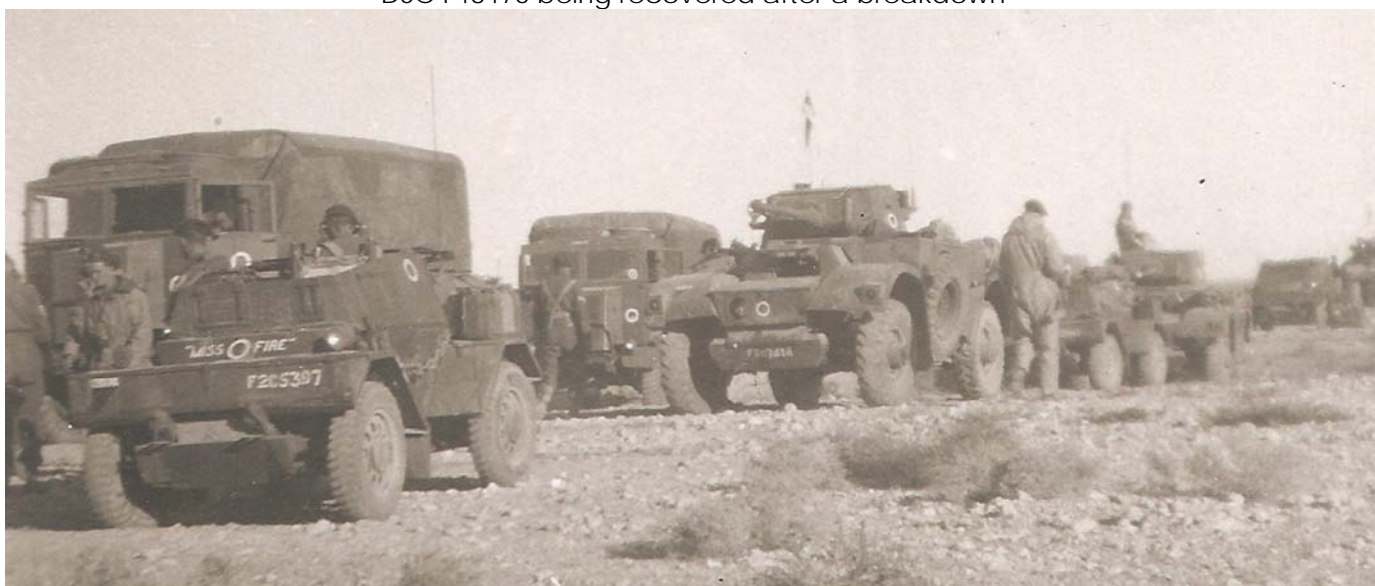
DSC F205397 named 'Miss - Fire'