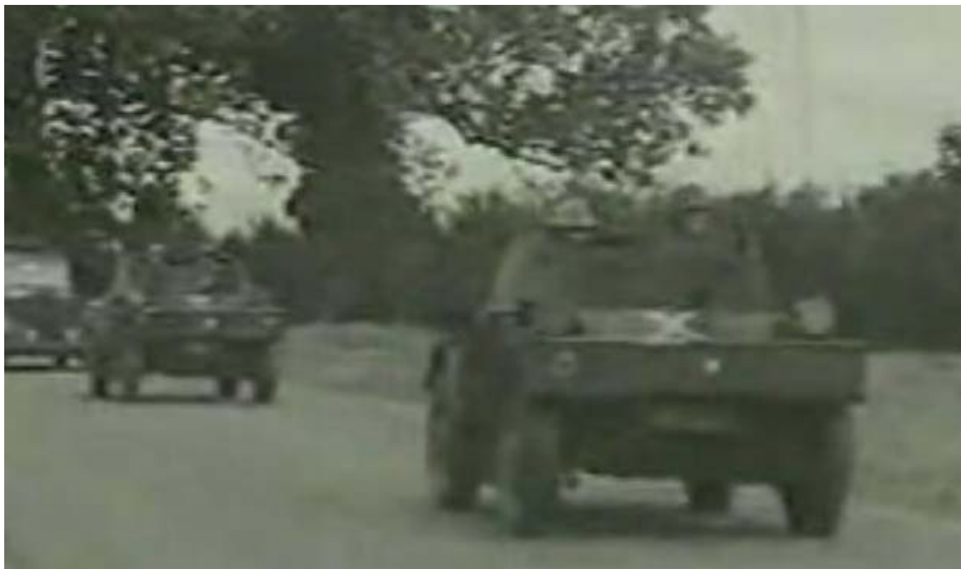
17-21 Lancers Patrol circa 1940