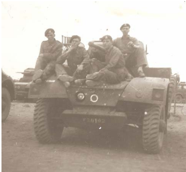
DAC F20192 Seuz

Although the war was over and the Empire dramatically reduced in size, the 16th/5th Lancers continued its tradition of service abroad. In 1948, almost immediately after its return from Germany, the Regiment served overseas for five years in Egypt (Cyrenaica and Tripolitania). This deployment was at a particularly sensitive time as the nationalist party in Egypt was gaining influence. This came to a head in 1952 with the overthrow of King Farouk by the republican nationalist Colonel Nasser, marking the beginning of the end of British influence in the Near East.