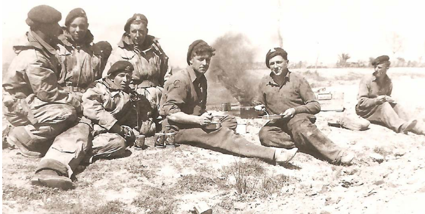
Despensing with the use of their No2 cook sets, the crew here use the famous Bengazi cooker