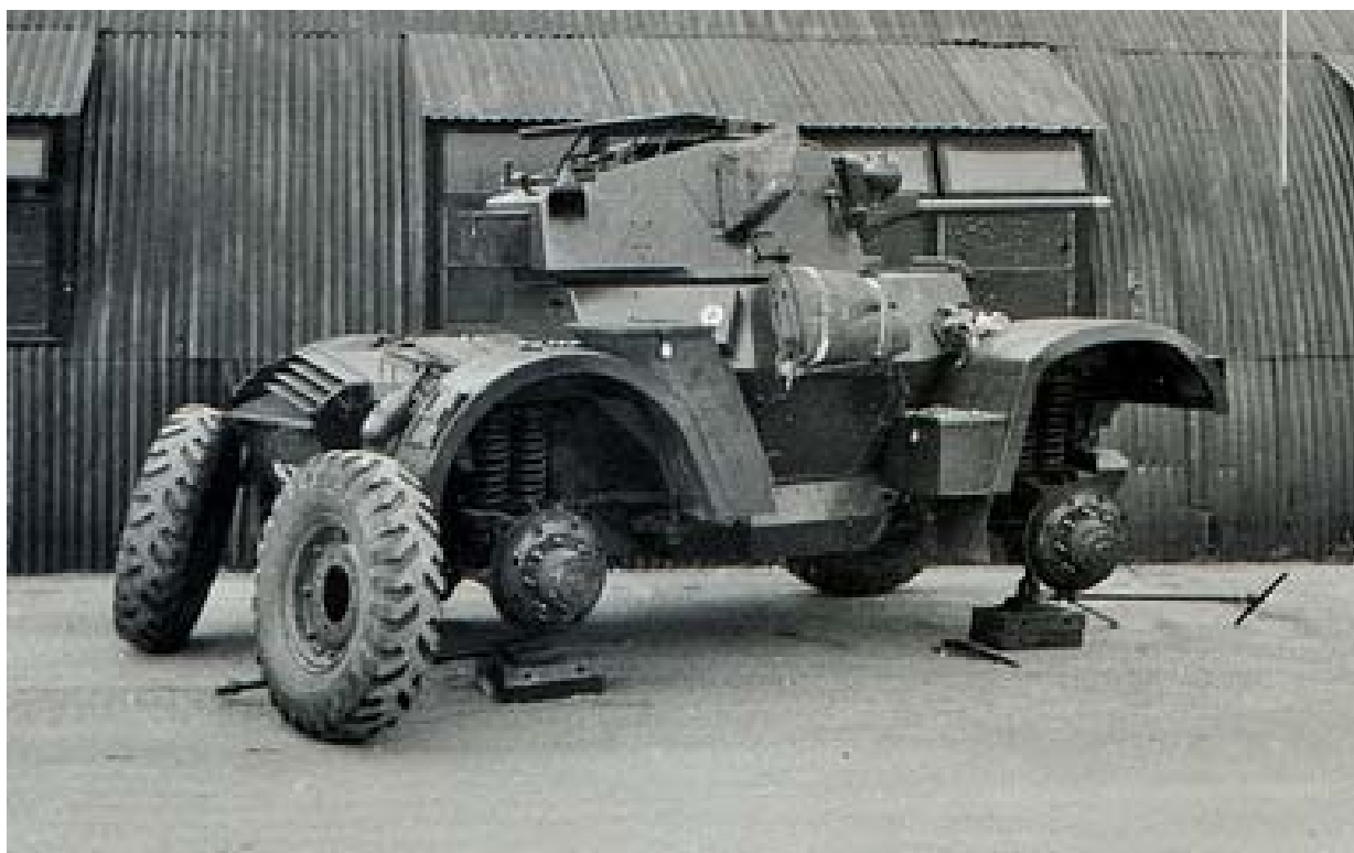
Daimler Armoured Car receiving REME attention, Castlemartin 1959

Yeomanry RGH. LBH, FFY, WD, 3CLY, 4CLY, NY, ERY, RDY The Daimler Fighting Vehicles Project – Part D6b www.daimler-fighting-vehicles.co.uk