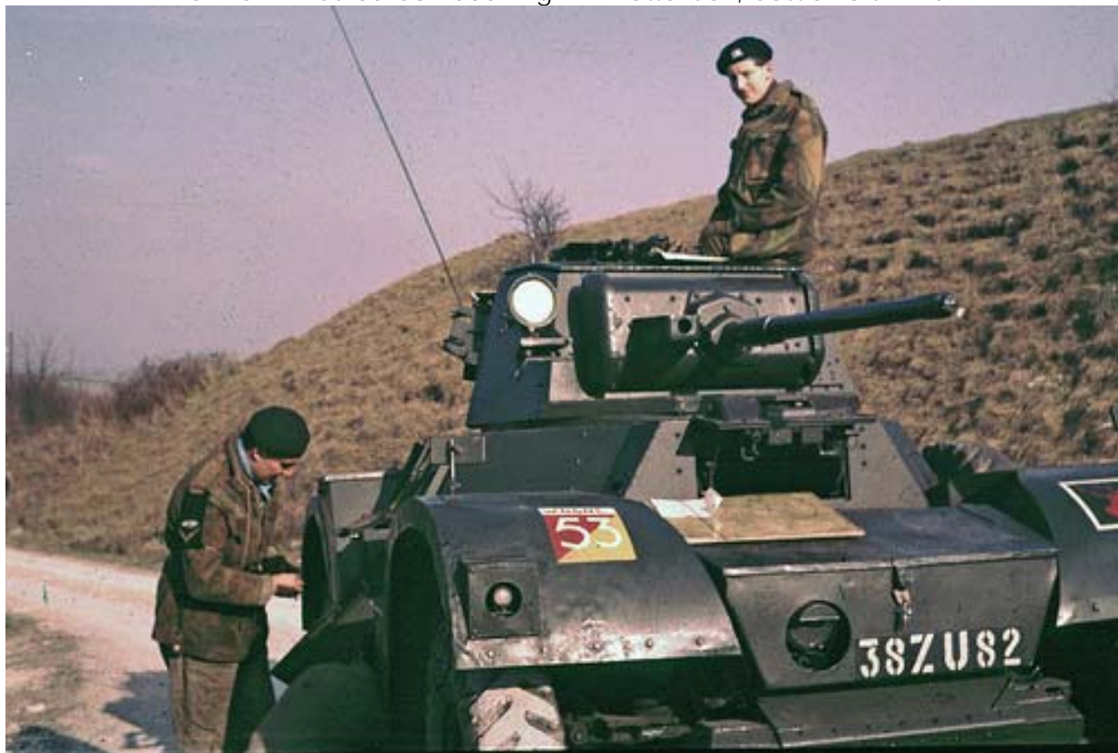
Photo taken c1960 shows DAC F207930 38ZU82 of C Squadron Westminster Dragoons on a weekend exercise.