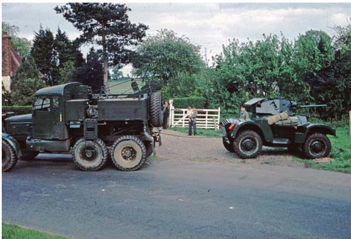
Photo taken on a C Squadron weekend shows a Daimler Armoured Car being recovered by the REME LAD Scammell.