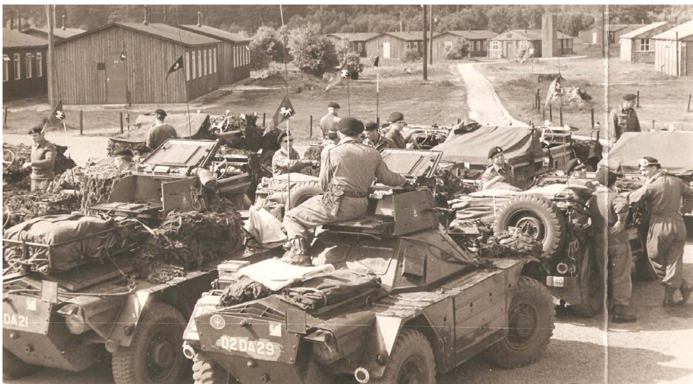
Description: Ferret scout car 02DA29 & 02DA21. Circa mid 1960's

Yeomanry RGH. LBH, FFY, WD, 3CLY, 4CLY, NY, ERY, RDY The Daimler Fighting Vehicles Project – Part D6b www.daimler-fighting-vehicles.co.uk