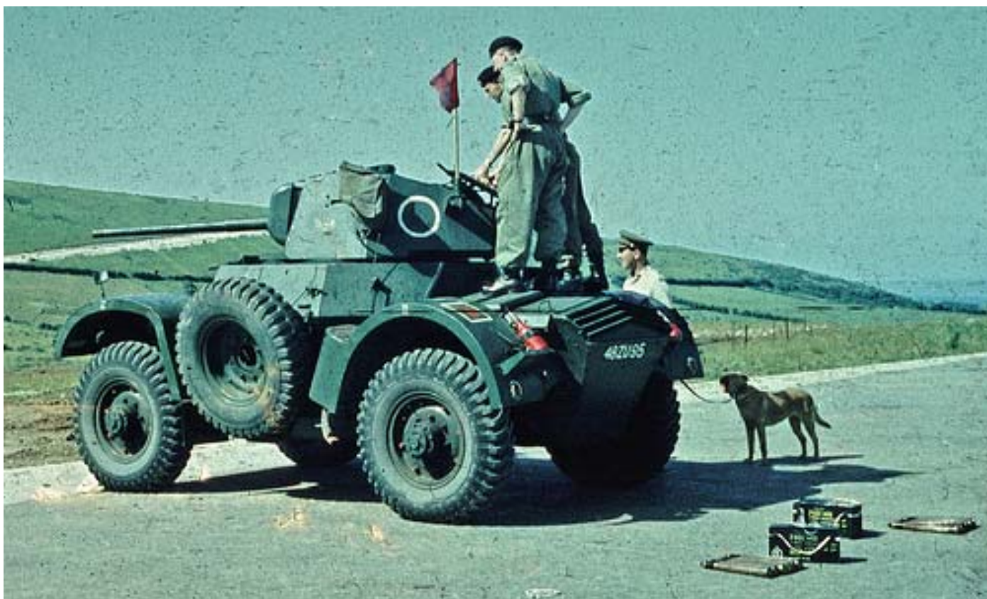
DAC F107544 48ZU95

Yeomanry RGH. LBH, FFY, WD, 3CLY, 4CLY, NY, ERY, RDY The Daimler Fighting Vehicles Project – Part D6b www.daimler-fighting-vehicles.co.uk