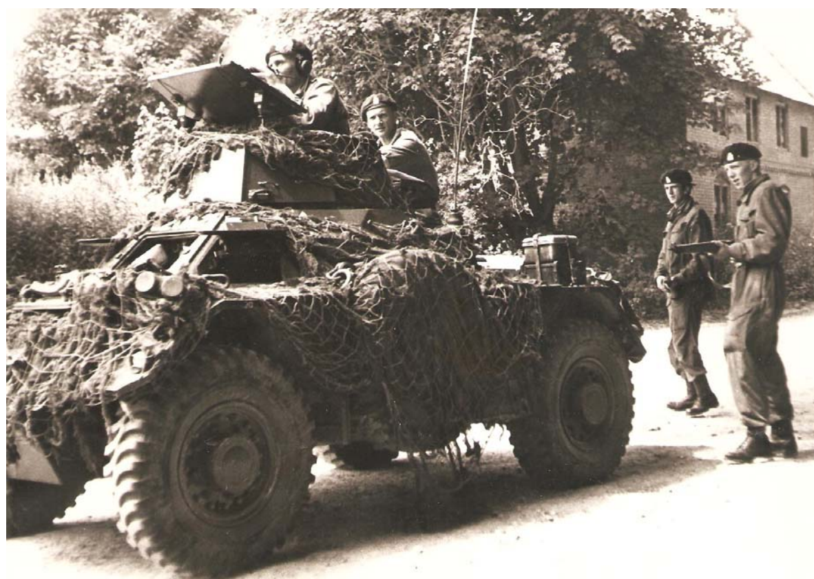
Description: Ferret scout car 02DA21 on a training exercise