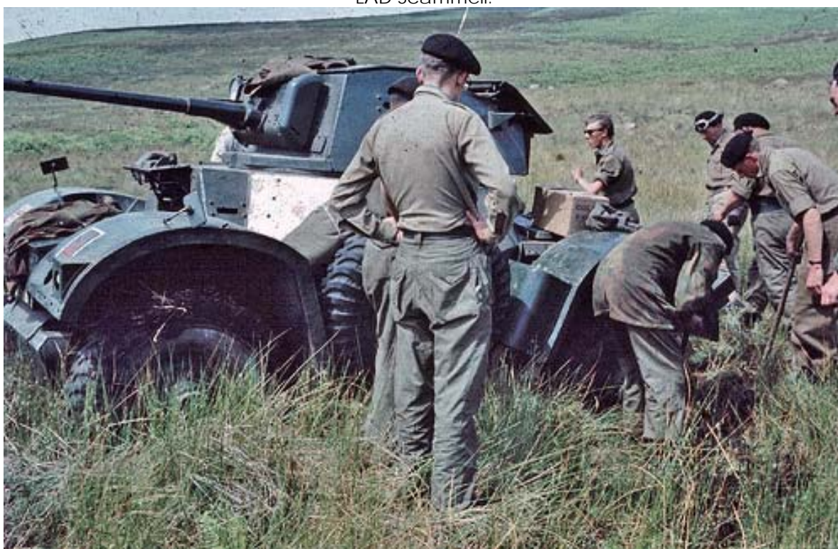
Picture taken at annual camp, Bellerby, North Yorkshire c1960. The bogged DAC was eventually winched out by an AER REME unit sharing the camp that year.