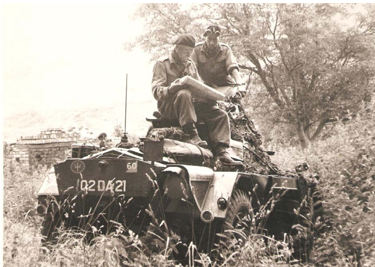
Image courtesy of Robin Mayes. Photographer 6287257 Cpl Bert Mayes. Description: Ferret scout car 02DA21 with Cpl Mayes reading the map. Circa mid 1960's